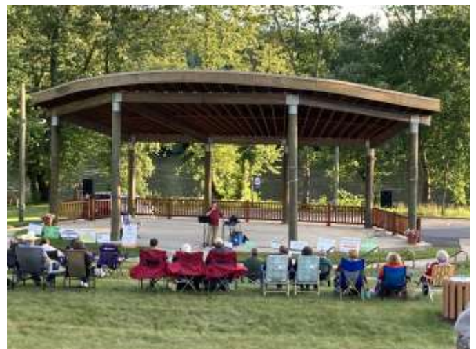
This year's first Concert in the Park