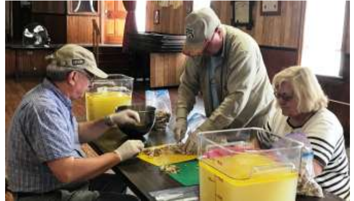
Some of the volunteers from Perry Valley who recently helped with preparations for the Pomona Grange fair concession.