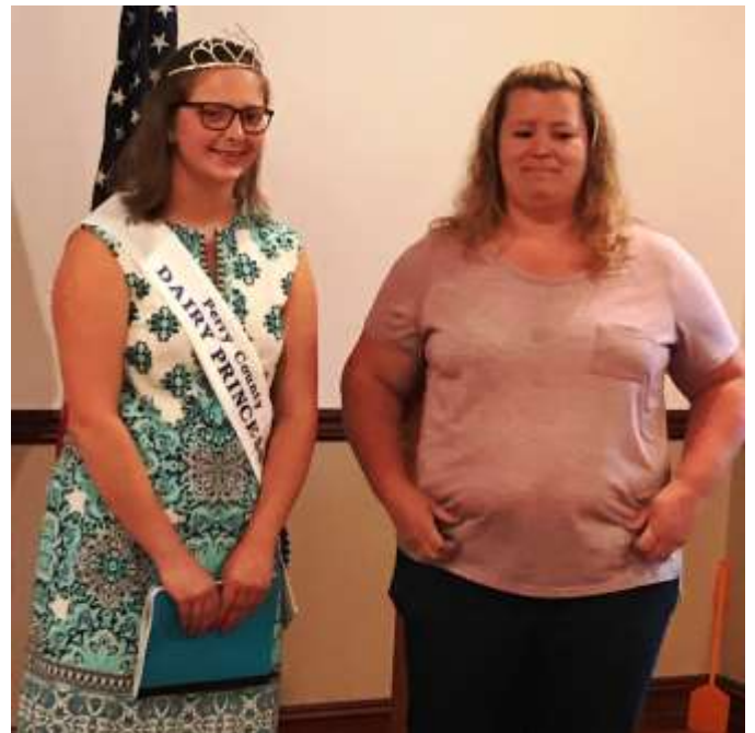
At our June meeting the Perry County Dairy Princess (left) spoke on the dairy industry and the importance of dairy products in daily diets.